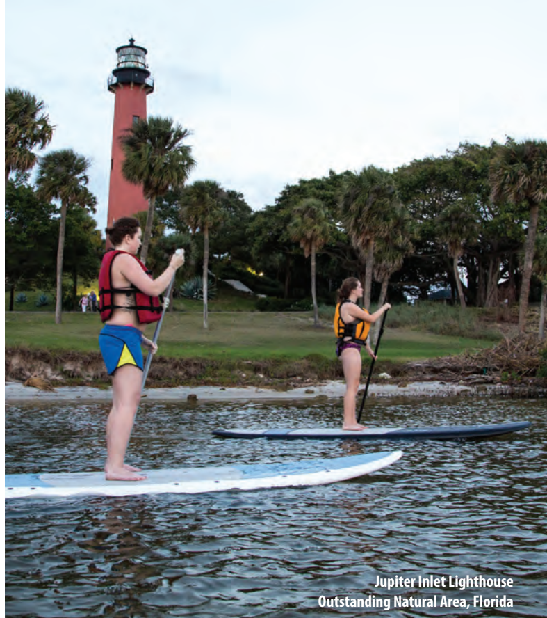
Jupiter Inlet Lighthouse Outstanding Natural Area, Florida